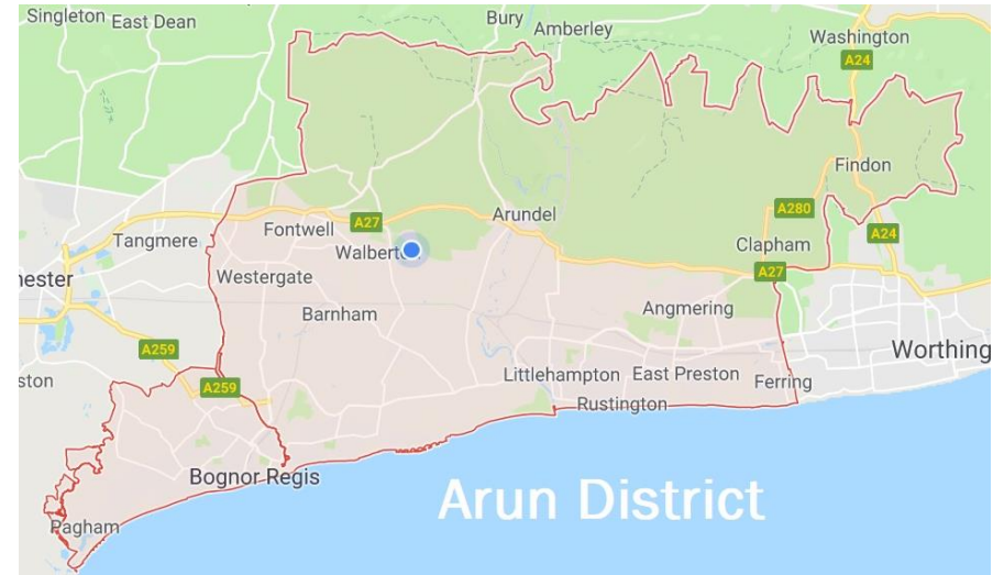
Map of Arun District