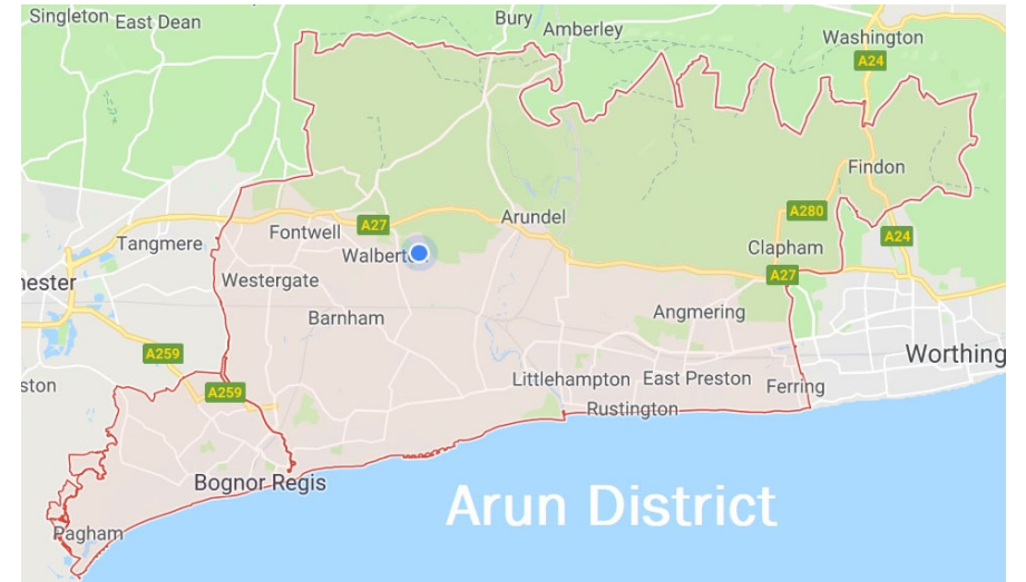
Map of Arun District